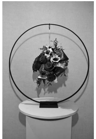
Day 1, Class 101, 1st Place Designer's Choice, Diane Cochran