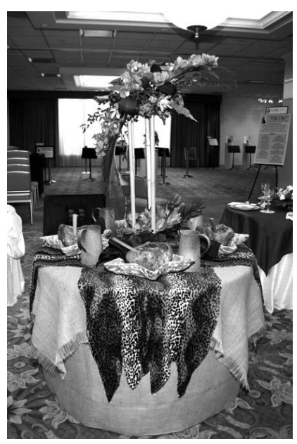
Day 2, Class106 Garden Club of Hyannis