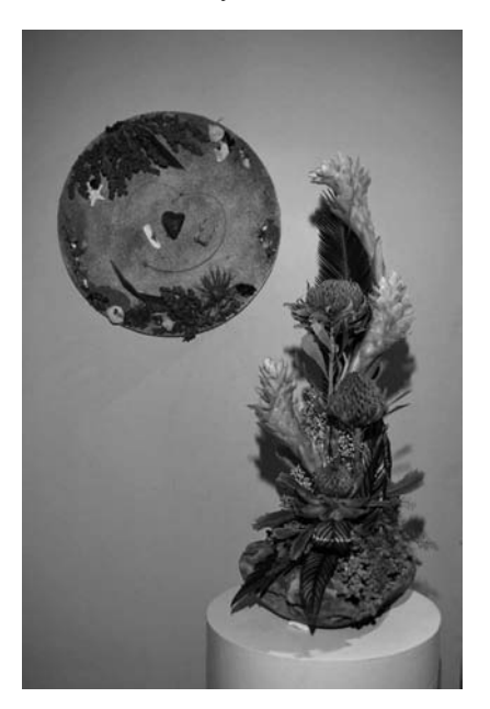
Day 1, Class 102B, 1st, Tricolor, Priscilla Styer