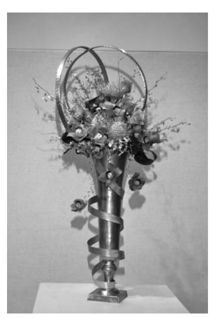
Day 1, Class 107, Diane Bullock Award, Diane Bullock