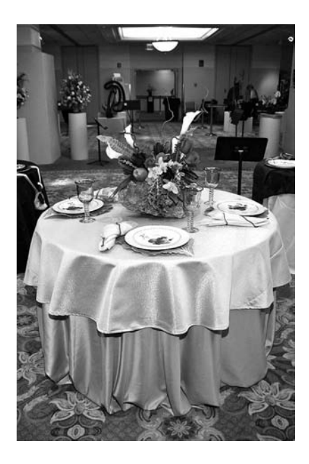
Day 1, Class 106, 1st Place, Community GC of Duxbury