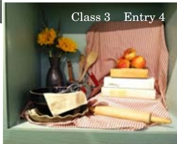
Class 3 Entry 4