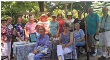
Waltham GC members took a field trip to Hollis, NH.