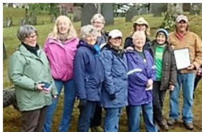
Photo top of right column: Groton GC members co-sponsored an Arbor Day tree planting.

Pepperell Garden Club members enjoyed a day at the Bridge of Flowers, which crosses the Deerfield River, linking the small towns of Buckland and Shelburne Falls. Taking time to "smell the flowers," members admired the clusters of shrubs and vines on the fence and light posts.