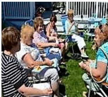
Peabody GC members relax after touring a member's garden.