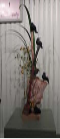
Class 1 Entry 3 Connie McCausland Town & Country