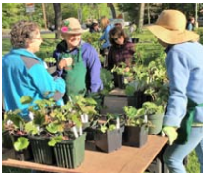
West Newbury GC members and customers at their spring plant sale

Stoneham Garden Club enjoyed a busy spring with a successful plant sale, annual meeting and planting in town square. The club also launched a junior garden club, with eager students participating in a variety of projects at the town library.