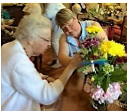
North Andover GC members held a floral design workshop with assisted living residents.