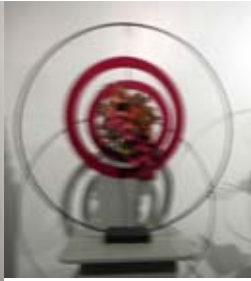
Class 2 Entry 1 Suzanne Sav- age