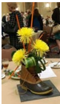
traveled to the meeting. Tours included the Wadsworth-Longfellow House garden, Maine Historical Society Museum, Gulf of Maine Research Institute and the Portland Museum of Art. (Pictured

For Tuesday, Wednesday and Thursday, individual committees met to talk about programs and plan for the upcoming year's projects. Friday was a day of tours and special events for those who had