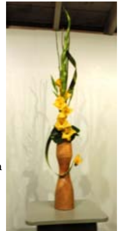
Class 5 Entry 1 Elaine DiGiovanni Belmont GC