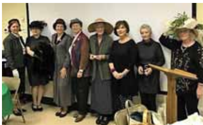
Members of The GC of Harvard celebrated the club’s 90 th anniversary in period costumes.