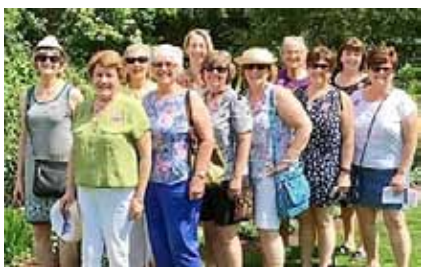
Franklin GC members enjoyed a summer visit to Blithewold.

bers visited Blithewold Mansion and Gardens in Bristol, Rhode Island, enjoying a self-guided tour followed by a private tea and lunch. In late September members divided and sold perennials from their gardens at the Franklin Farmer's Market; proceeds benefited the club's community activities, including a scholarship program and an Arbor Day celebration featuring free pine tree seedlings for the town's first graders.