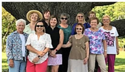
Reading GC members enjoyed a tour of Stevens-Coolidge Place.