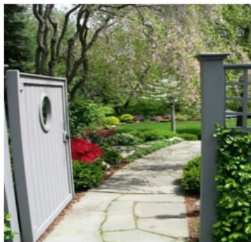
Entrance to the site of Lexington Field & GC's recent fundraiser.

available for sale. This new initiative included a silent auction of goods and services, as well as refreshments. Event proceeds will be used for continued work at Emery Park, one of Lexington's most visible and frequently used public spaces.