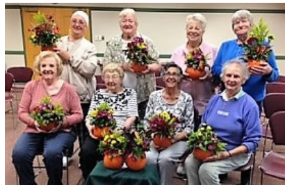
Hamilton/Wenham GC helped to build community with a creative garden therapy workshop.

pated in a garden therapy workshop, followed by “spring therapy” with two presentations on tulips: first a fascinating historic account of these magnificent bulbs, followed by a special field trip to a local bulb distributor.