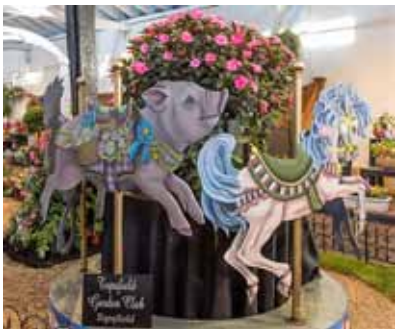
Topsfield GC's winning garden display at the Topsfield Fair