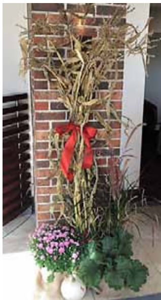
One of Holliston GC's decorations for the recent America in Bloom symposium.

Holliston Garden Club (HGC) , which collaborates on town beautification projects with the local chapter of America in Bloom (AIB), worked especially hard over the summer and fall to prepare for AIB's 2017 national symposium. The event was held in Holliston in mid-October: the organization's first visit to New England. New HGC projects included the installation of a bird and pollinator garden at the back of the town library. Members also helped plant and maintain a new 350-foot border in the center of town. To welcome AIB's 200+ symposium attendees, club members helped decorate the meeting venue with cornstalks and mums, and provided centerpieces and stage decorations.