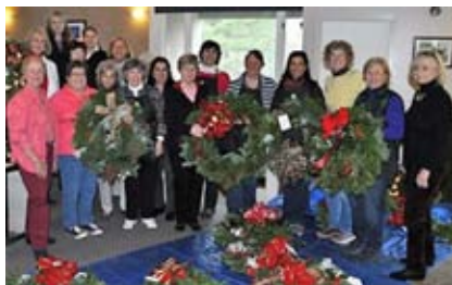
North Andover GC wreath makers

The North Andover Garden Club gathered in late November to enjoy a Green's Workshop and potluck luncheon. Wreaths were decorated and distributed to the town's public buildings. Members new to wreath-making learned how to do it, using greens, berries and festive bows.