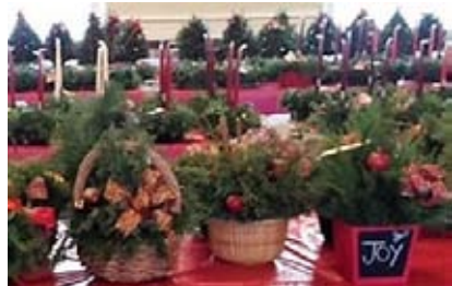
Selected items from the Medfield GC annual Greens Sale