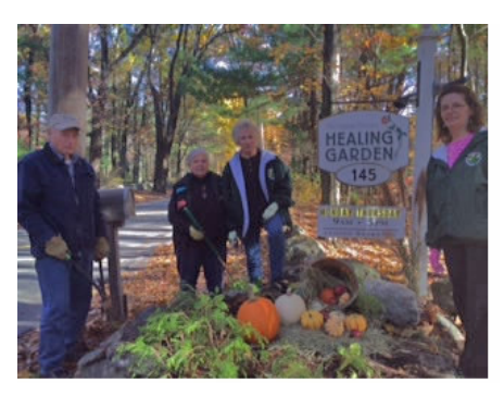
Four of the many garden club members who cleaned up beds at the Healing Garden

den Club. Volunteers cleaned four garden beds and two water features, planted daffodil bulbs, and decorated containers for the fall season.